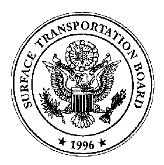
April 12, 1996